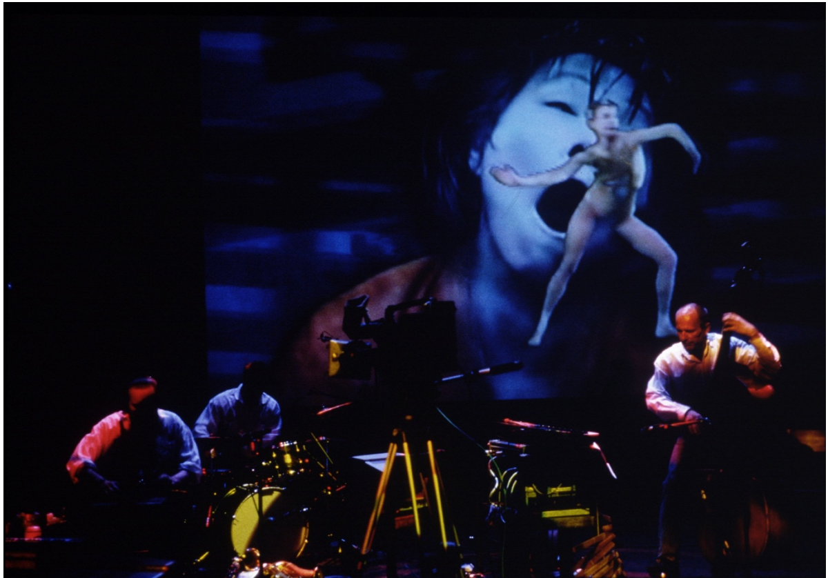
A scene from the Kiasma Theatre stage, the telepresence performance, 5th of June 1998

A three-part interdisciplinary media art project: